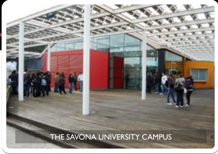
THE SAVONA UNIVERSITY CAMPUS